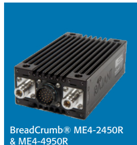
BreadCrumb® ME4-2450R & ME4-4950R