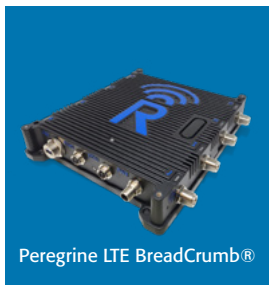
Peregrine LTE BreadCrumb®