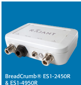
BreadCrumb® ES1-2450R & ES1-4950R