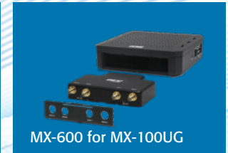
MX-600 for MX-100UG