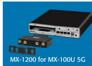
MX-1200 for MX-100U 5G