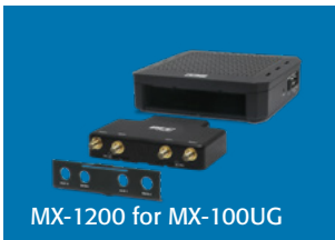
MX-1200 for MX-100UG