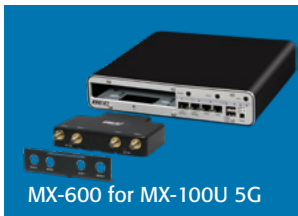
MX-600 for MX-100U 5G